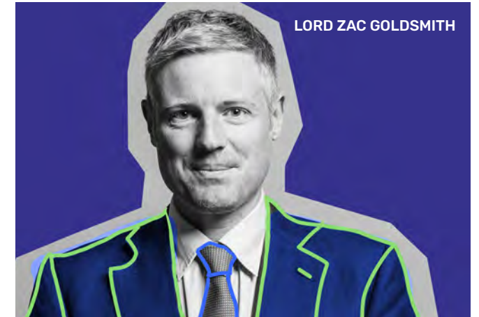
LORD ZAC GOLDSMITH

GLOBAL SOUTH CO CHAIR OF THE COP26 CIVIL SOCIETY AND YOUTH ADVISORY COUNCIL AND THE FOUNDER OF THE GREEN GENERATIONAL INITIATIVE