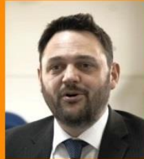
Coast to Capital Growth Champion Consulting Support

"It was clear the energy and ability the Growth Champion had to extract key information and transpose it into a plan was excellent. Communication, understanding of our business, and service was second to none!"