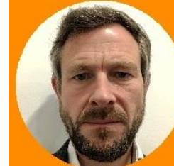
Coast to Capital Growth Advisor 1-2-1 Support

"We're set fair for the future. It's no exaggeration to say that without Coast to Capital, GBE would not be where it is today."