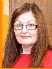
Coast to Capital Peer to peer group Escalator Programme

Business strategy, growth grants, peer learning, Growth Champion services and 1-2-1 knowledge transfer support