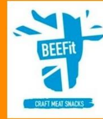
Coast to Capital Growth Grant recipient

"Completion of our new factory is a business changing step for us which we would not have been able to achieve without the grant from Coast to Capital."