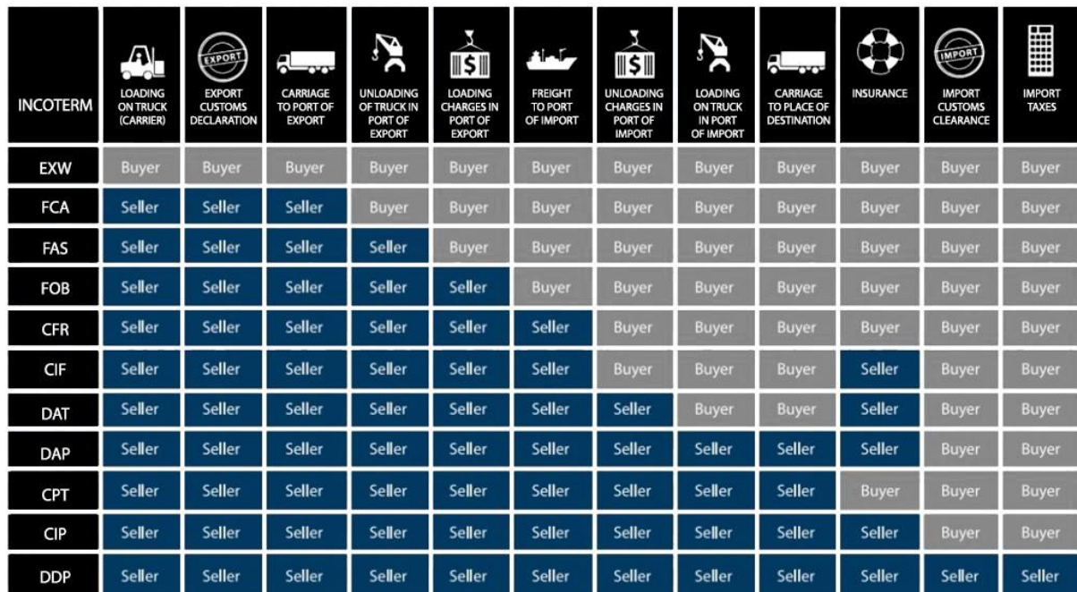
Figure 1 - Chart above shows where the responsibility changes from Seller to Buyer.

Recently the ICC changed basic aspects of the definitions of a number of INCOTERMS, buyers and sellers should be aware of this. Terms that have changed have a star alongside them.