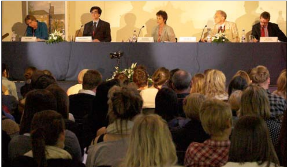
Parliamentary candidates answer questions from Guildford College students.

After each offered a snapshot of their policies in a two-minute speech, they fielded questions on subjects ranging from engaging young voters and the handling of the economy to student debt and tuition fees, help with managing personal finances, the value of university degrees and education spending cuts.