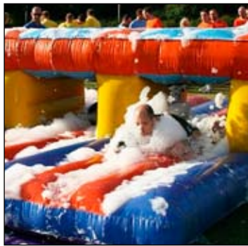
A taste of things to come at the Knockout Challenge?